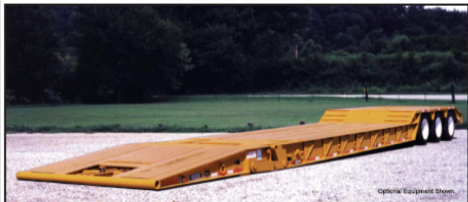
Optional Equipment Shown.