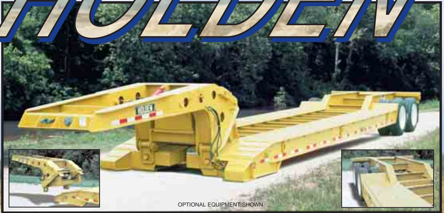
OPTIONAL EQUIPMENT SHOWN